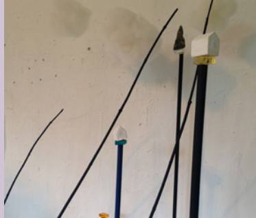
Lines of Negotiation

A group of Traveller women at Southside Travellers recreated a miniature replica trailer with the help of a local community arts worker. The group designed and built the trailer from scratch and have made and hand-sewn all of the interior furnishings. LexIcon Lab, Level 3 5.00–9.00pm