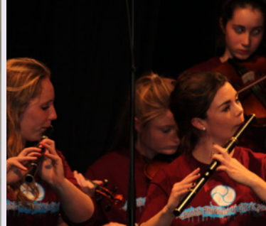
Cumann na nÓg