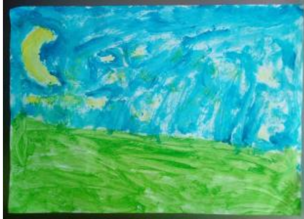
24 - Ines Chemil, age 8

"This use of a limited palette shows us how cool blues and greens can be"