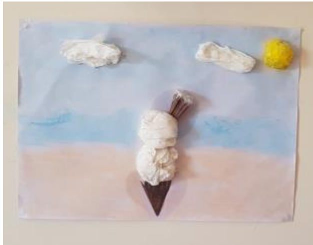
43 - Avvyukta Aiyer, age 9

"This artist makes us look out from behind a fence at the world of nature. It makes us want to jump over it and run through the mountains."