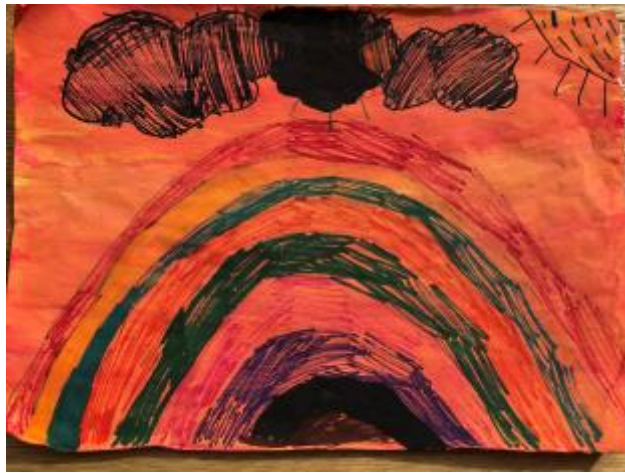
25 - Maeve Mc Cormick, age 6

"This use of a limited palette shows us how cool blues and greens can be"