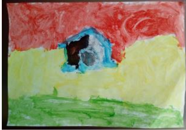
30 - Ines Chemil, age 8

"This little house looks very inviting on a day so warm the sky is red"