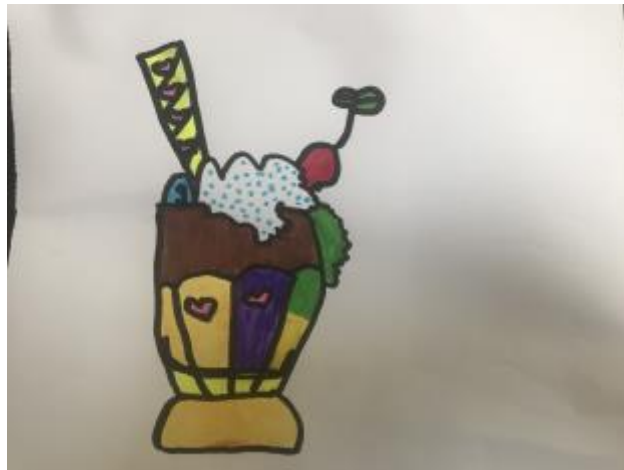
18 - Ellie Tanner, age 6

"The flowers are growing, the bees are buzzing and even the sun needs sun glasses. There is a lot happening and everything is moving which makes the picture interesting"