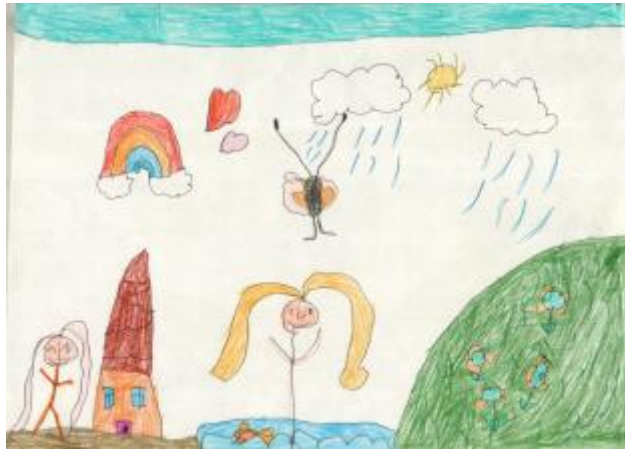
3 - Sofia Mancinelli, age 5

"I love the sense of celebration, it looks like there is music playing"