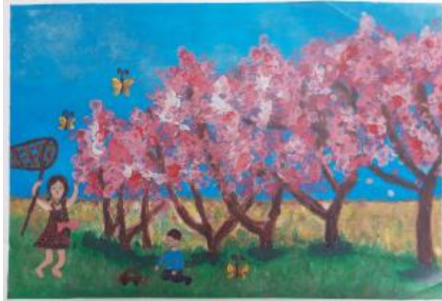
38 - Leja Matiukaite, age 11

"A blue sky, blossom trees, butterflies and two children playing on the grass. Summer invites us outside to make us smile"