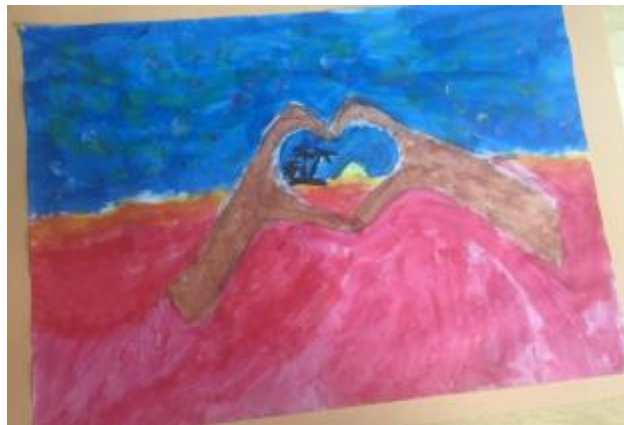
55 - Sian Wynne, age 10

"This sad looking man is all dressed up. He is saying he missed the train. It shows how even a sad story can make a good piece of art"