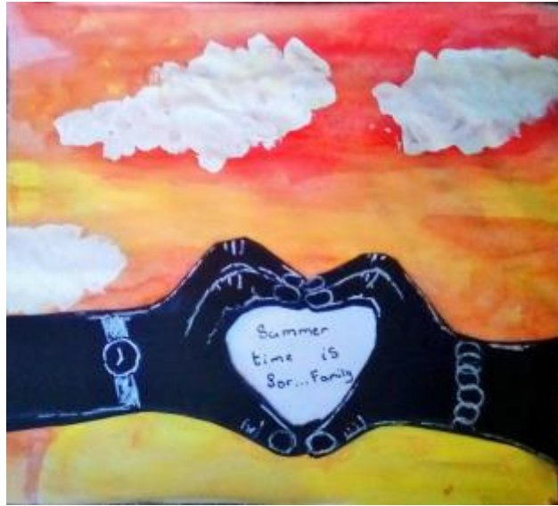
60 - Una Bull, age 10

"This artist is giving us a very important message in a painting full of summer reminders, sun, flowers and butterflies"