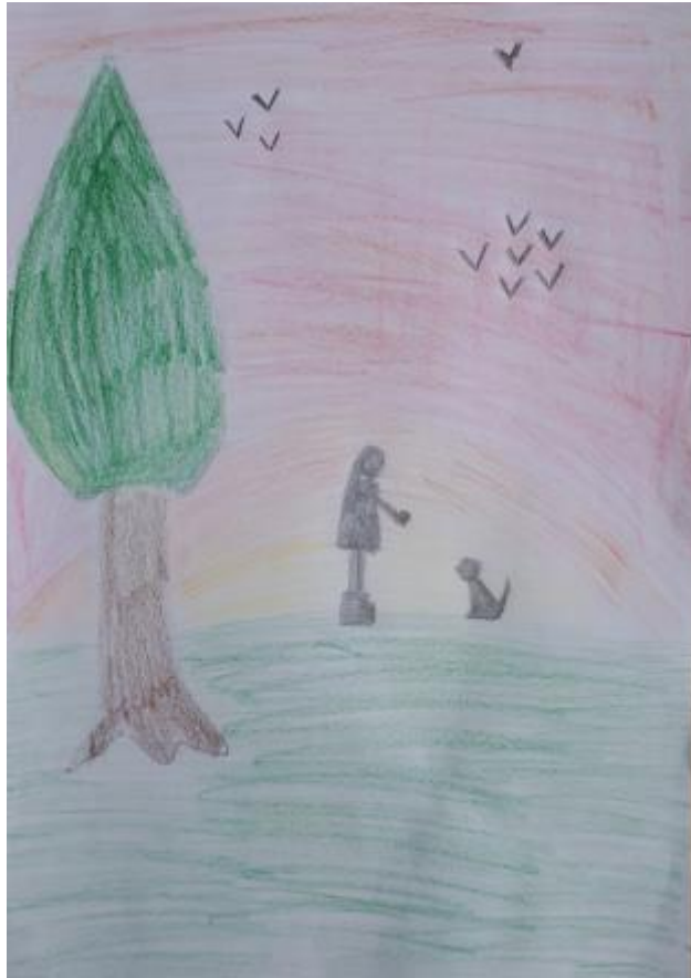
27 - Isla Garvie, age 8

"Two very active friends and a happy fish, this painting shows how important friendship is"