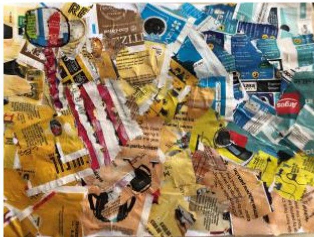
51 - Grace Nic Mathuna, age 11

"Everyone in this family is joining in the activities, even the dog. The sea looks inviting and the girl in the wet suit is dripping and smiling to tell us she is enjoying herself"