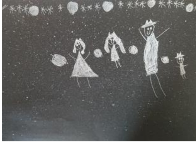
7 - Elena Kastanida, age 5

"What a lovely picture of happy people enjoying a warm summer night dancing under the stars, all smiles and stars"