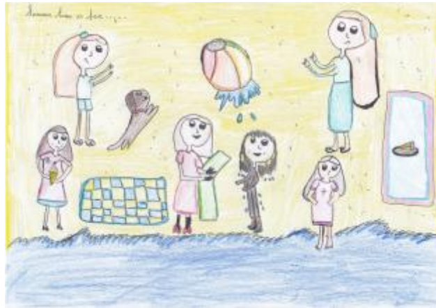
50 - Sara Minella, age 9

"The use of twigs, string, stones and beads creates shadows which add interest and movement to this picture"