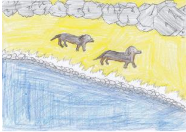
52 - Mattia Minelli, age 9

"Two dogs walking on the beach, they are both smiling, the sea looks inviting but they don't seem interested. The diagonal line of surf on the beach pulls the eye along nicely"