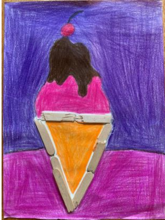
28 - Julia Bowe, age 7

"Terrific colour combination and the use of the ice pop stick adds a tactile element"