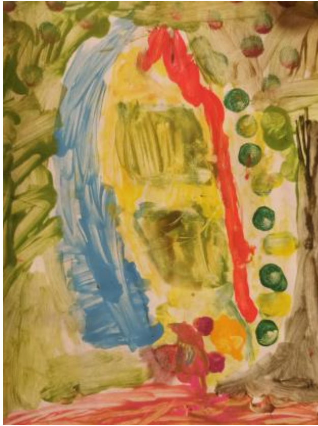
10 - Dean Hulshof, age 3

"This artist is showing us a beautiful warm yellow sun shining down on green trees and making us feel happy"