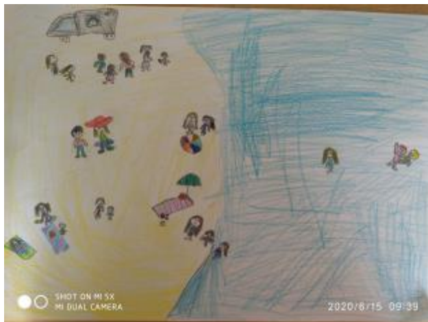
48 - Irie Stewart, age 10

"This painting of golden sand and waves in the sea tells us it is summer and we should all go to the beach. The limited use of colour makes a strong statement"