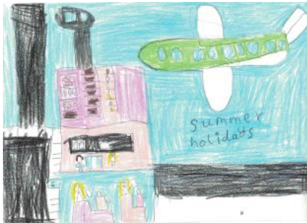
29 - Zoe Wood, age 6

"Terrific colour combination and the use of the ice pop stick adds a tactile element"