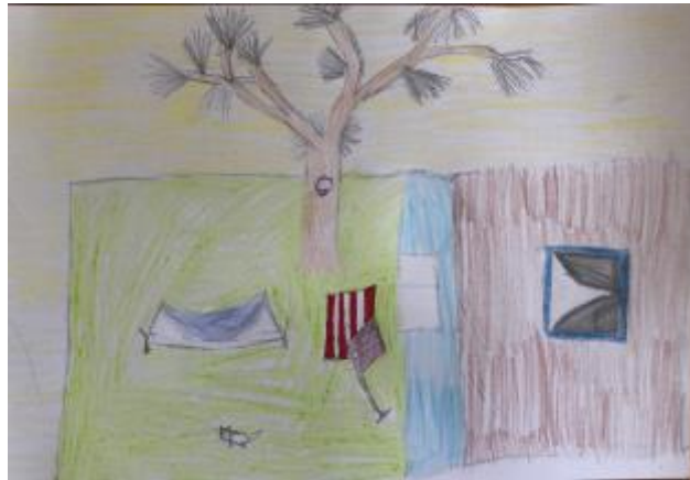
32 - Vanessa Jarmuzewska, age 7

"A big blue sky, a girl in shorts and a high ice cream. We can see that this girl is going to enjoy it"