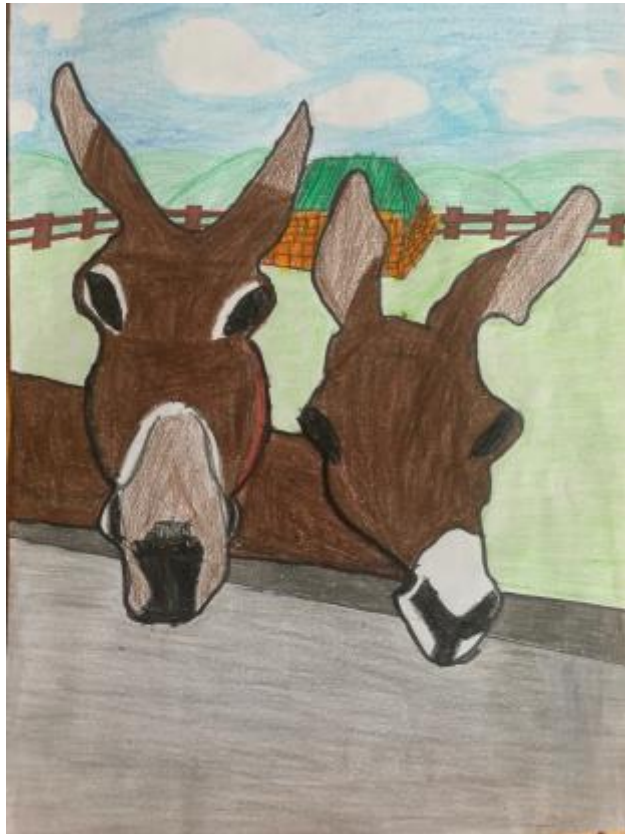
53 - Arnie Duffy, age 10

"Two dogs walking on the beach, they are both smiling, the sea looks inviting but they don't seem interested. The diagonal line of surf on the beach pulls the eye along nicely"