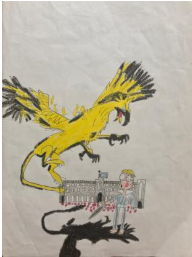
41 - Arnie Duffy, age 10

"The use of stripes of paint in the tree trunks, the grass, the girl's t-shirt and the book is very effective"