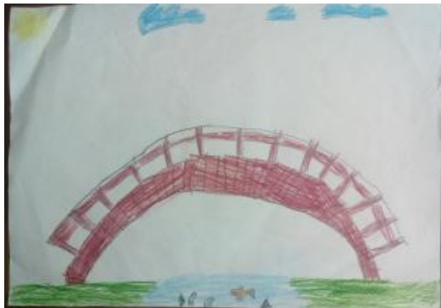
23 - Ines Chemil, age 8

"The sea is so big but the girl is such a good swimmer, she is like a super hero"