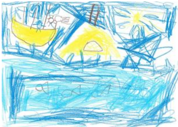
11 - Simon Groome, age 5

"This artist has a good sense of design, there is a sense of travel and movement and the red stripe draws the eye"