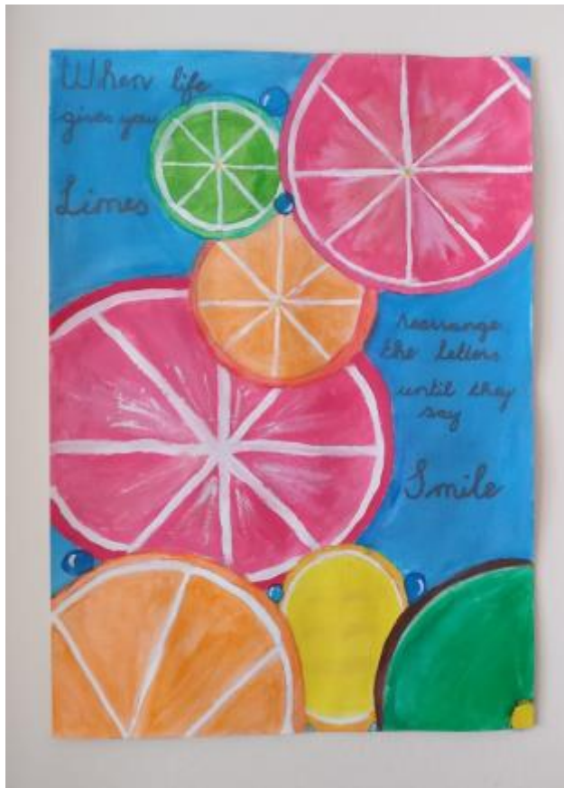
57 - Kasvi Goyal, age 11

"A relaxing picture of a frog enjoying greenery and the water"