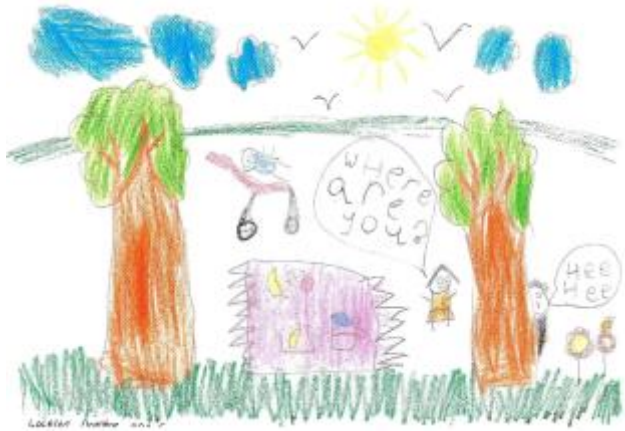
8 - Lochlann Donohue, age 5

"What a lovely picture of happy people enjoying a warm summer night dancing under the stars, all smiles and stars"