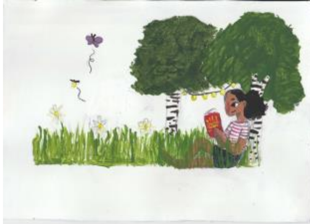
40 - Florence Chipperfield, age 12

"The use of stripes of paint in the tree trunks, the grass, the girl's t-shirt and the book is very effective"