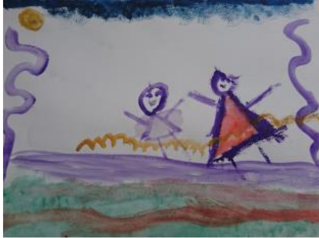
2 - Elena Kastanida, age 5

"I love the sense of celebration, it looks like there is music playing"