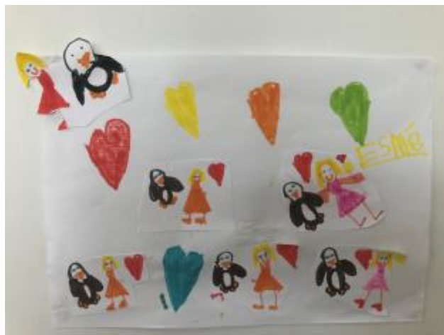
6 - Esme O'Connor, age 5

"This happy person is inviting us all to participate in growing plants in the earth and this gardener's smile is irresistible"