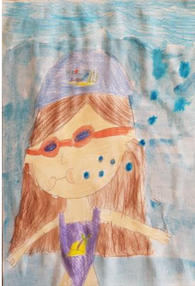
22 - Iseult O'Neill, age 8

"The sea is so big but the girl is such a good swimmer, she is like a super hero"