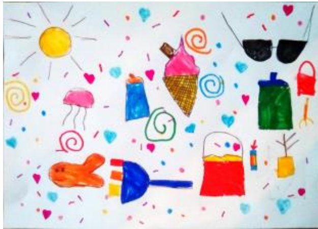
20 - Fiona Bull, age 7

"This looks like a lovely, cool place to be in the summer, and this artist obviously enjoys drawing plants"