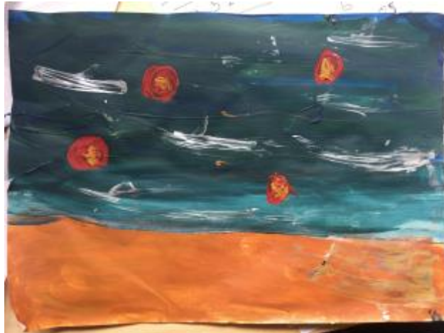
47 - Ingrid Cannon, Age 9

"This painting of golden sand and waves in the sea tells us it is summer and we should all go to the beach. The limited use of colour makes a strong statement"