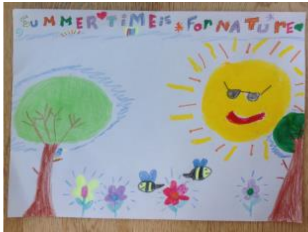
17 - Fern Morrison, age 8

"Convertibles are such a good way to travel on a warm summer day, with the wind in your hair and the road ahead leading to the mountains"