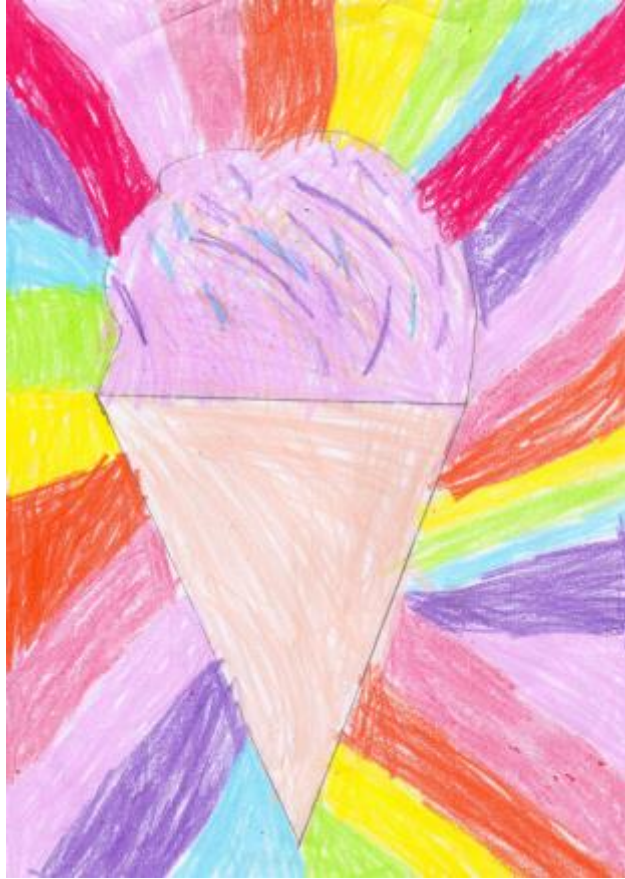
21 - Katie Mc Nelis, age 7

"This artist seems to be telling us how everything cheers up and is more colourful when we eat ice cream!"