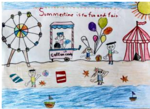
33 - Anvi Agarwal, age 7

"A beautiful tree, a tent and a cat. In summer we can camp in the garden"