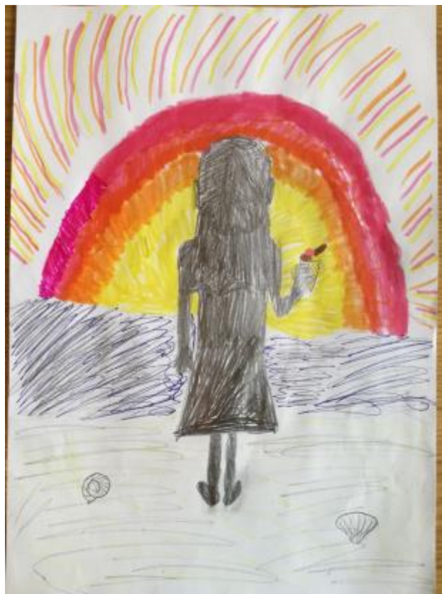
39 - Juno Cleary Kennedy, age 10

"A blue sky, blossom trees, butterflies and two children playing on the grass. Summer invites us outside to make us smile"