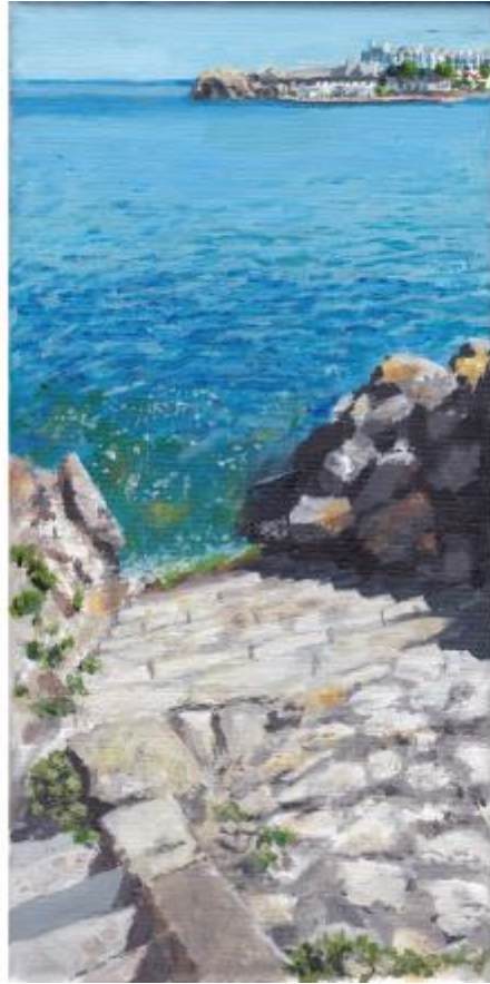
36 - Ruairi Condon, age 12

"This painting is a warm invitation to descend the steps and experience the smell, the feel and the delicious coolness of the sea"