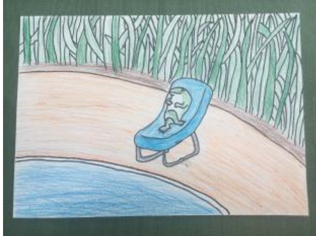
56 - Niall Meghan, age 11

"A relaxing picture of a frog enjoying greenery and the water"