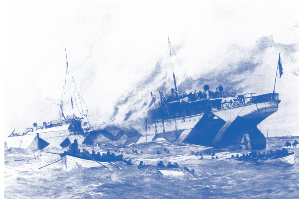
'A contemporary drawing showing the sinking of the RMS Leinster. Reproduced as the cover for Torpedoed! The RMS Leinster Disaster by Philip Lecane.'

Venue: Dublin's Pro-Cathedral, Marlborough Street, Dublin 1 at 11:00