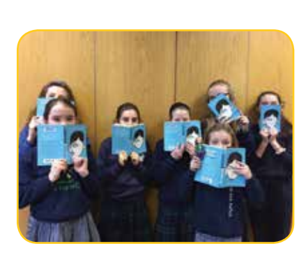
Lexicon Children's Book Club

Watch out for their 'I Am Dún Laoghaire' writing and illustration exhibition in October in dlr LexIcon.