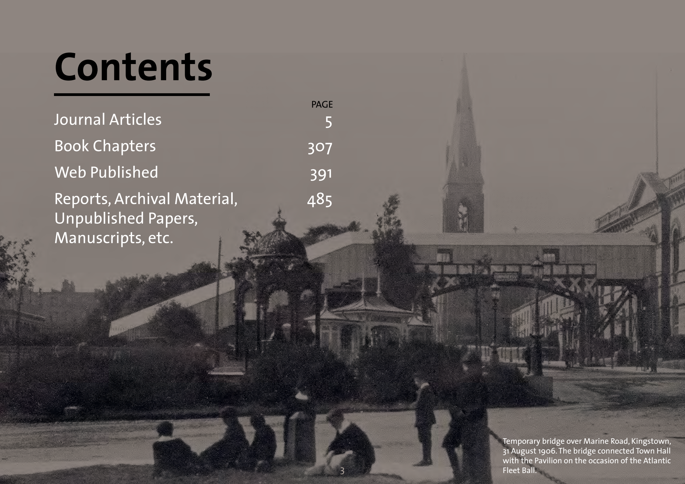
Temporary bridge over Marine Road, Kingstown, 31 August 1906. The bridge connected Town Hall with the Pavilion on the occasion of the Atlantic Fleet Ball.