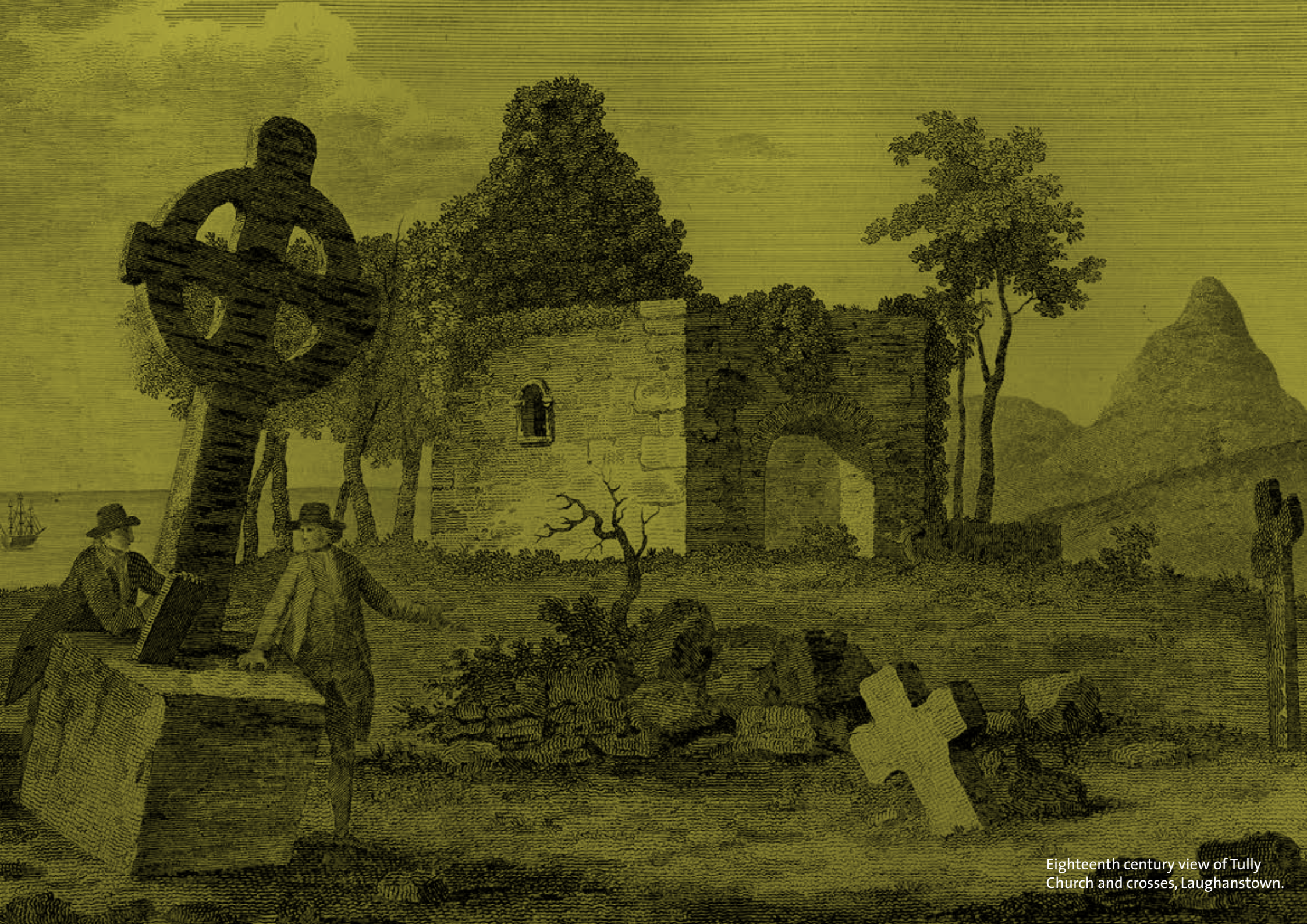
Eighteenth century view of Tully Church and crosses, Laughanstown.