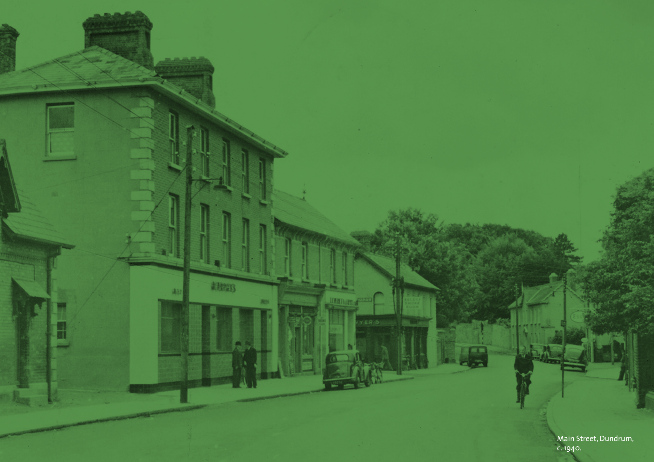
Main Street, Dundrum, c. 1940.