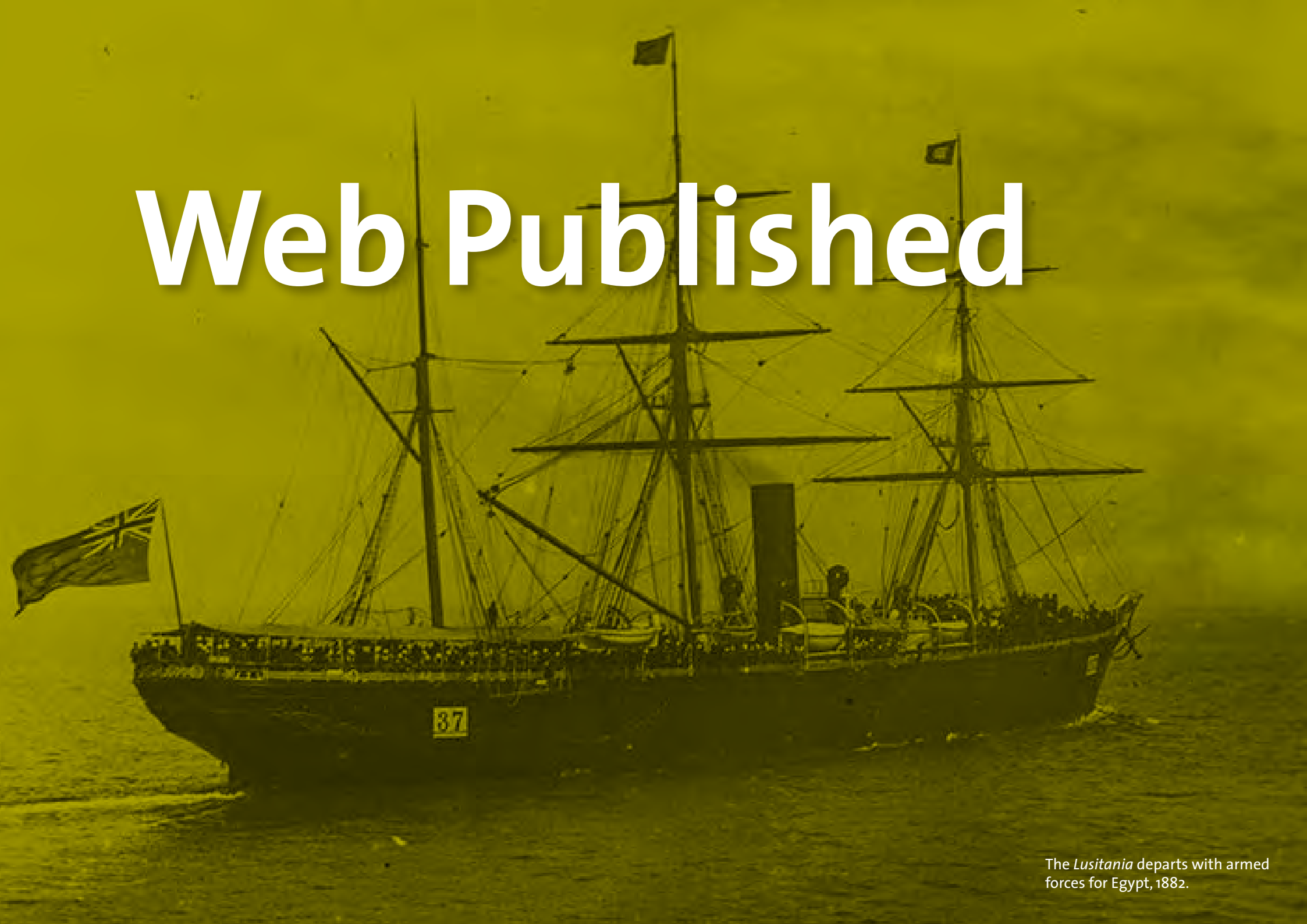
The Lusitania departs with armed forces for Egypt, 1882.