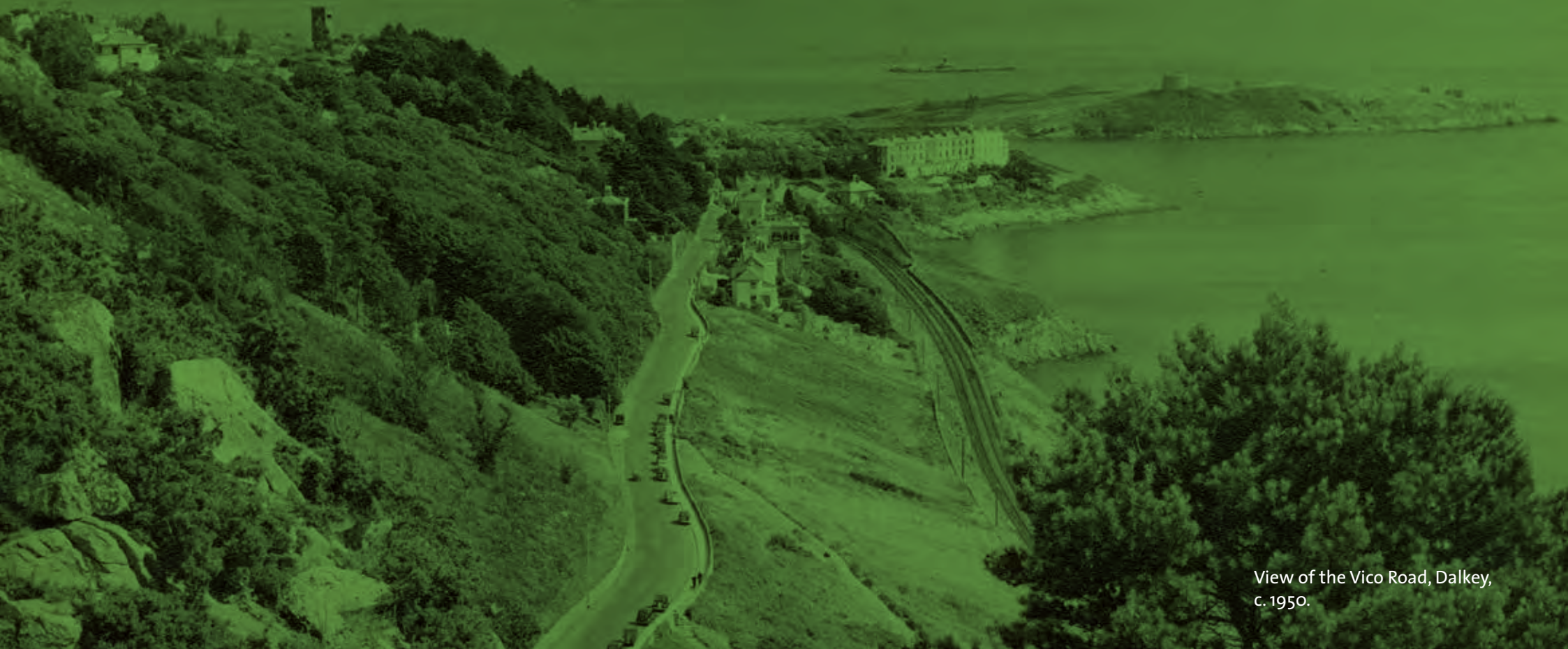
View of the Vico Road, Dalkey, c. 1950.