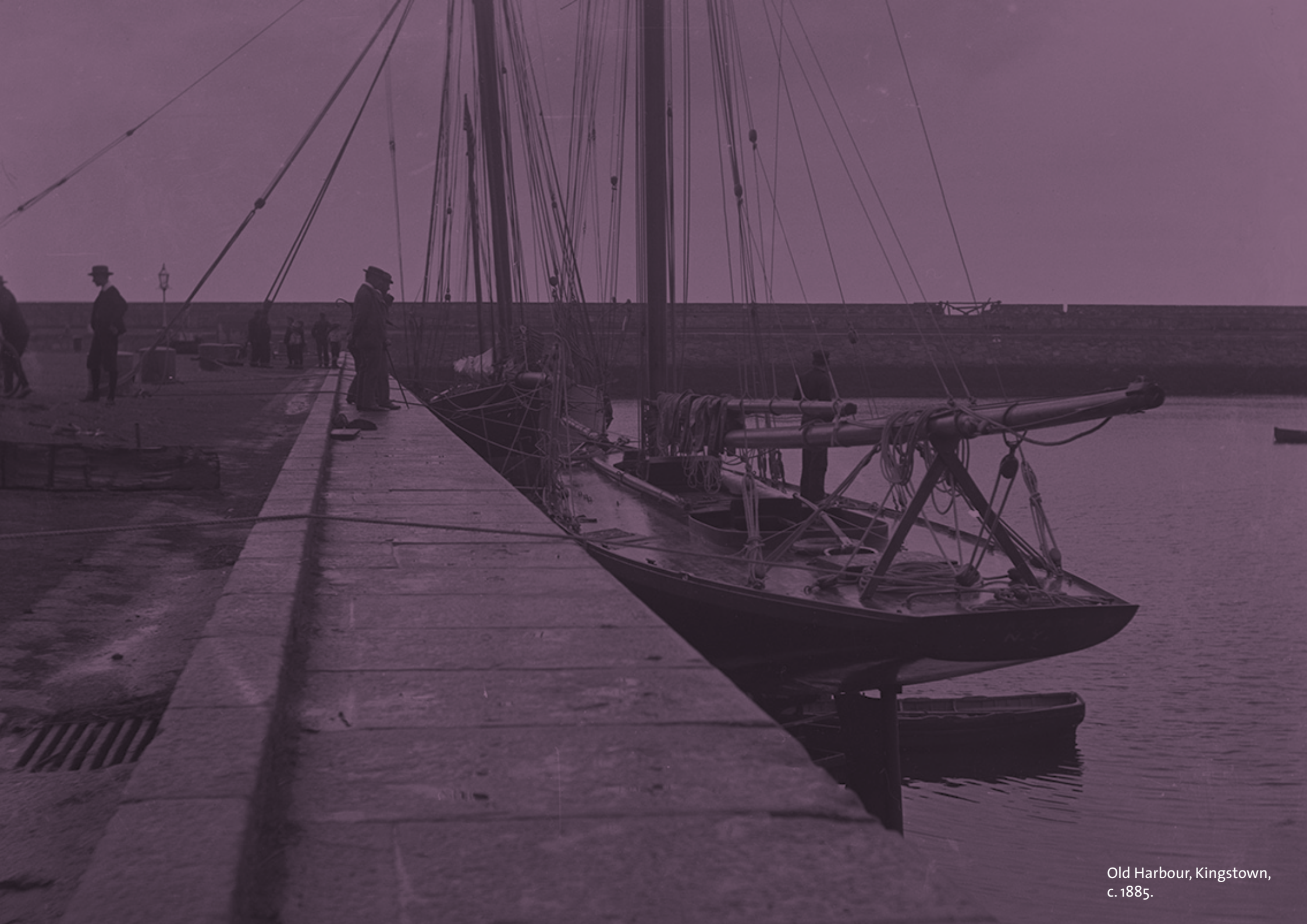
Old Harbour, Kingstown, c. 1885.