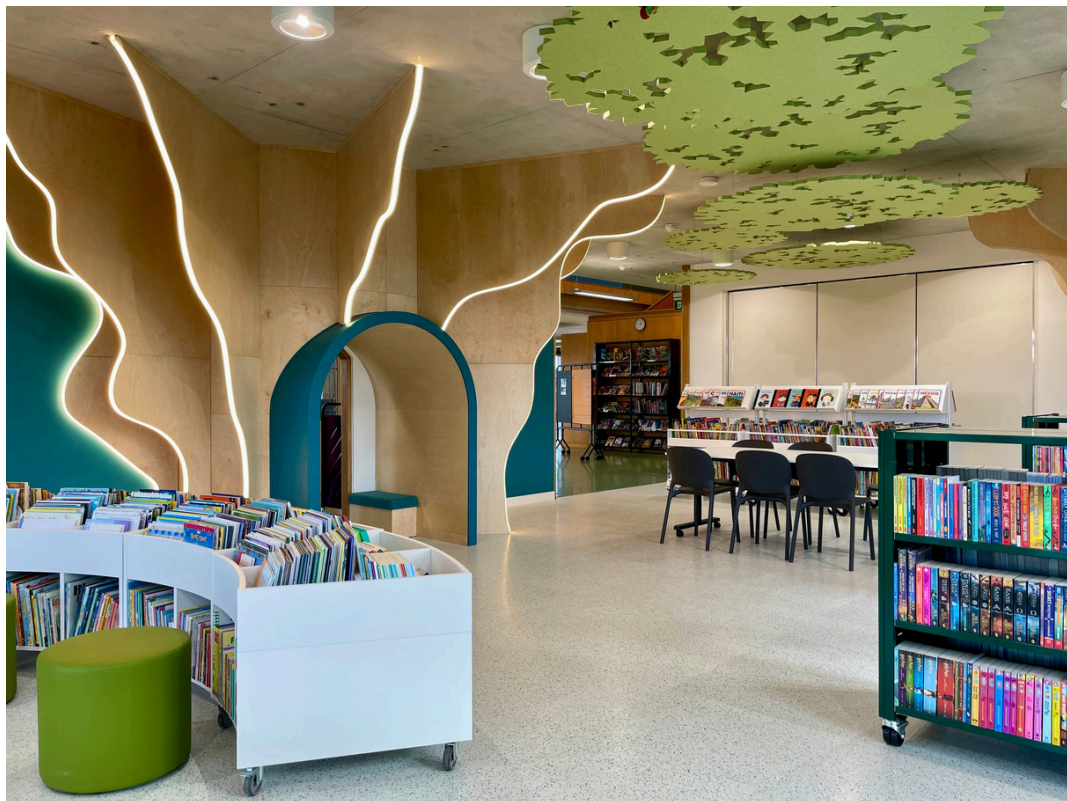
This is the Junior Library.