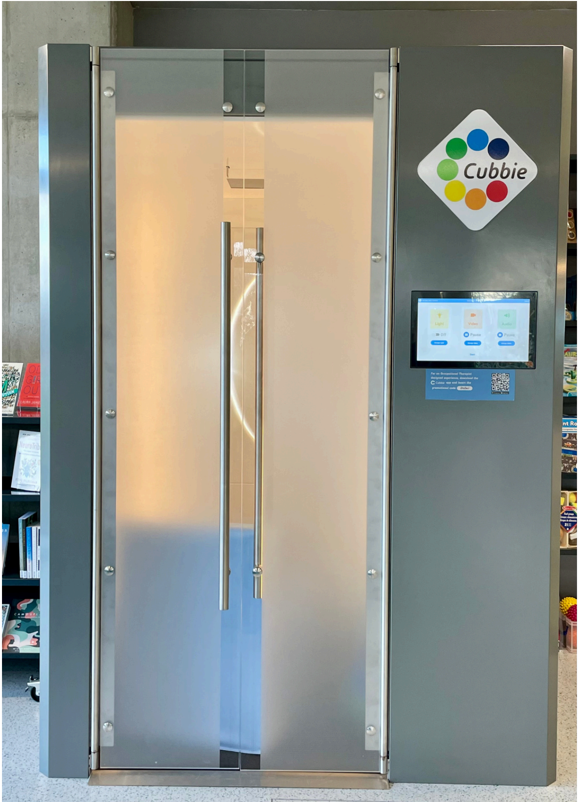
This is the Cubbie Sensory Hub.