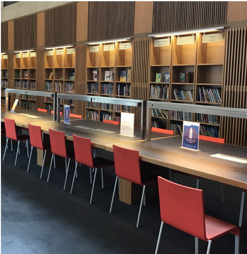
Children's Non Fiction Section (Left) and Children's Fiction (below)