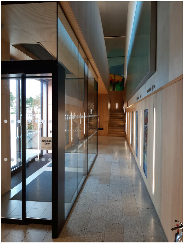
Interior entrance on L1