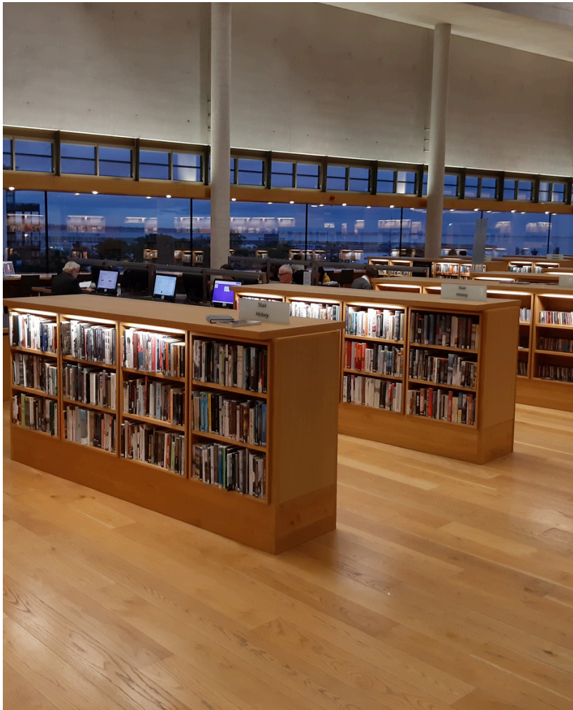
Adult Fiction on L4