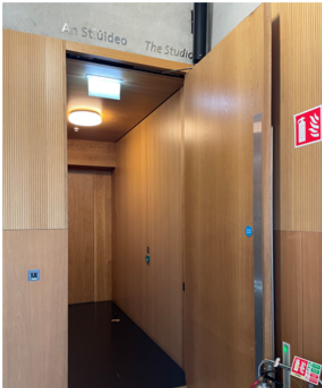
Entrance to The Studio from the café on Level 1 (left) and Young Adult and Lab area (below)