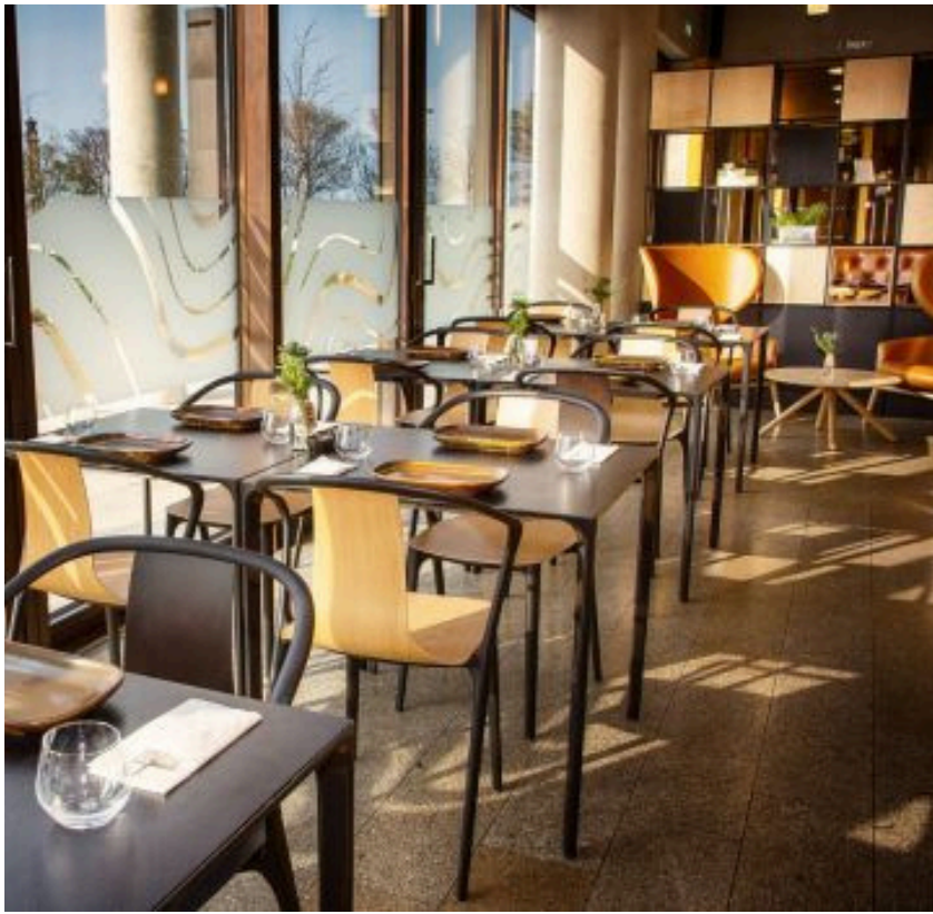
Cafe on L1