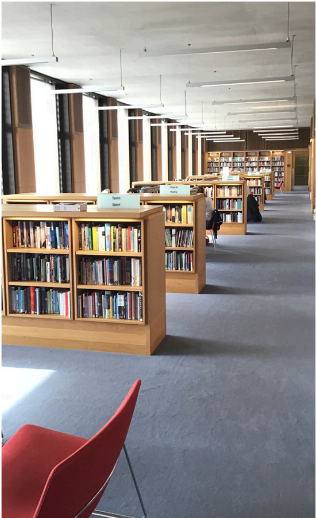
Adult Non Fiction on L4